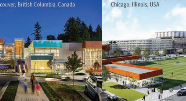
Delbrook Community Centre North Vancouver, British Columbia, Canada