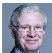
Lord Nigel Crisp

Principal, Greenberg Consultants, Canada