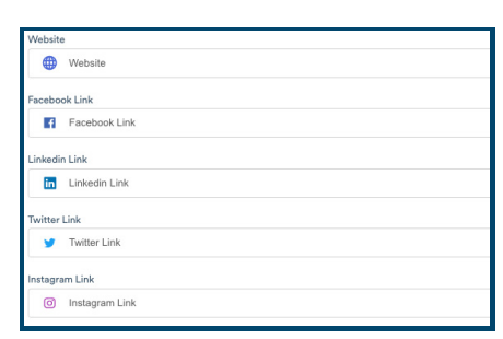
Add your social links