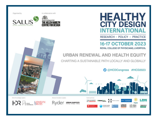
Event log in page

Once you're logged into the event you can start adding sessions to your agenda, view sponsors and partners booths, view and connect to other attendees, send messages and set up in-person and virtual meetings.