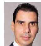
MARIOS THEMISTOCLEOUS Deputy Minister of Health, Hellenic Ministry of Health, Greece